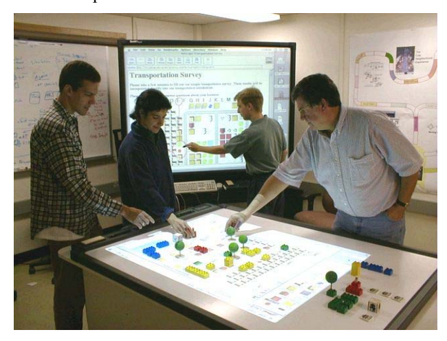
Figure 1: The EDC Environment

To move beyond frameworks that are based solely on providing access to existing information, we have been developing the Envisionment and Discovery Collaboratory (EDC) [Arias et al., 2000]. The central theoretical vision of the EDC is to provide contextualized support for reflection-in-action [Schön, 1983] within collaborative design activities. The EDC combines an action space, implemented as a game-game-board on which physical objects are placed by the users and sensed by an underlying simulation, with a reflection-space, implemented as an open-ended information environment that holds and manages the considerable amount of information required to understand complex situations and alternate perspectives. In Figure 1 the horizontal surface is the action space and the vertical surface is the reflection space.