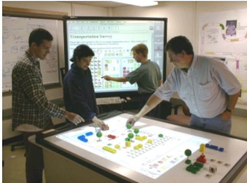
Figure 2. The current prototype of the EDC.

information, etc.). The EDC framework has been applied to different domains including: (1) courses taught at schools and universities [dePaula et al., 2001], and (2) professional communities ranging from those in assistive technology development to designers in architecture and urban planning; and (3) different communities to support their lifelong learning efforts. Figure 2 shows the current prototype of the EDC that explored urban transportation planning as an application domain.