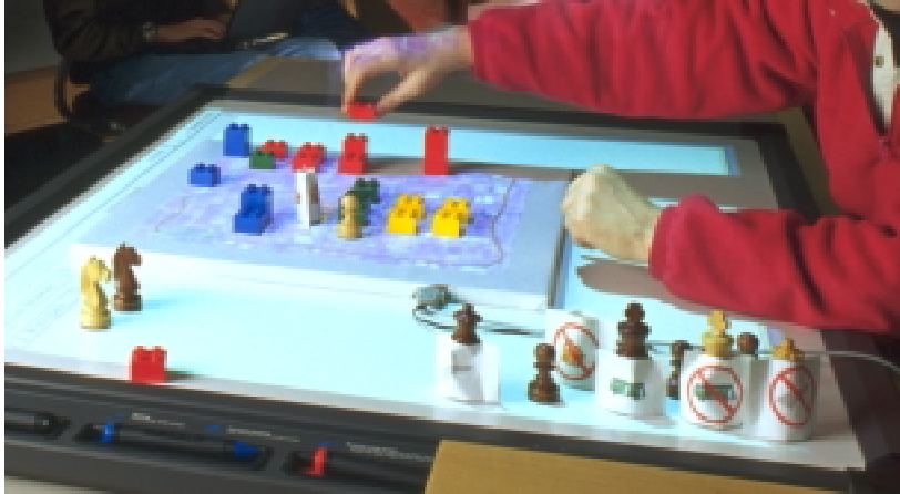
Figure 3. The “Chessboard” Environment.

Table 1 summarizes the differences between DODEs and the EDC.